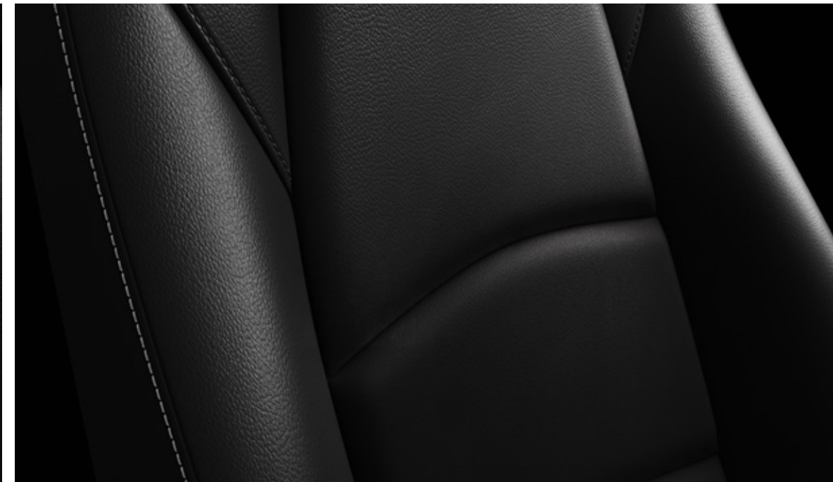
Black Maztex (G20 Evolve)