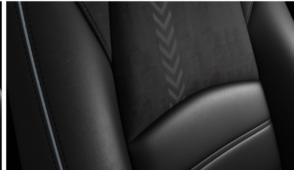
Black Maztex and Grey Grand Luxe ® Synthetic Suede (G20 GT SP)