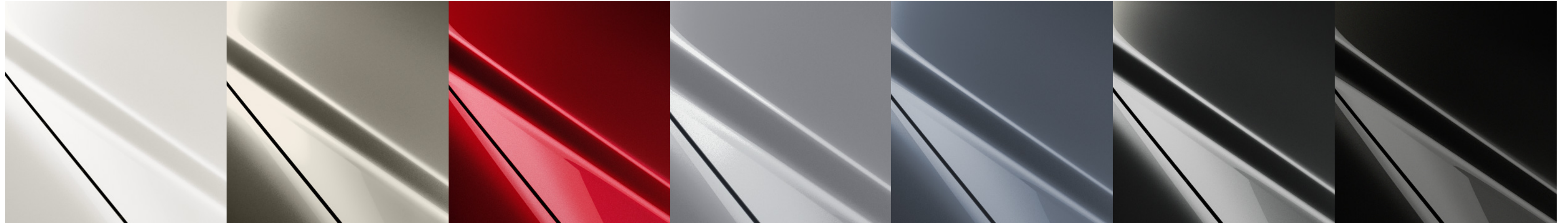
Snowflake White Pearl Mica