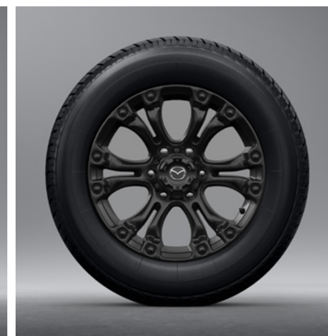
18-inch satin black alloy on Thunder model