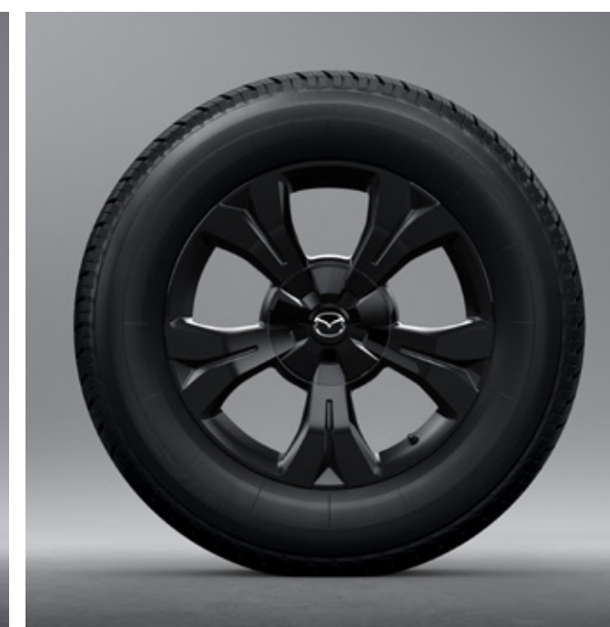
18-inch metallic black alloy on SP model