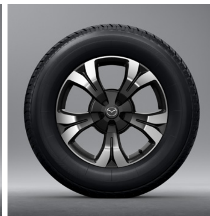
18-inch black and machined alloy on XTR and GT models