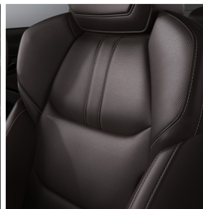
Brown leather# (GT & Thunder)