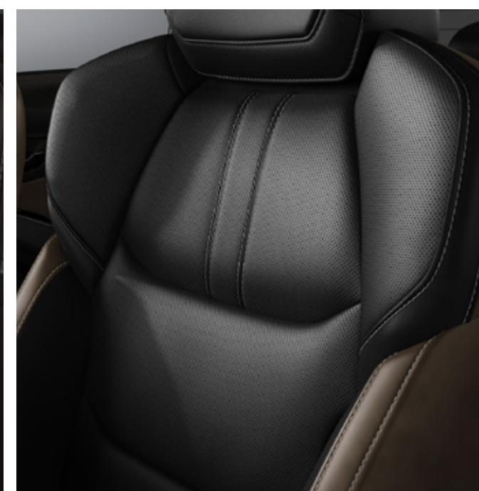
Black & Driftwood leather (SP)