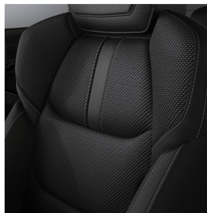
Black cloth (XT and XTR)