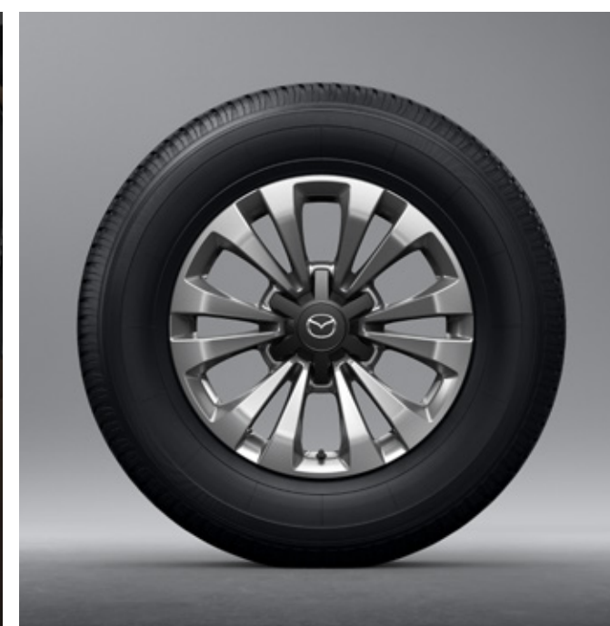
17-inch alloy on XS 4X4 and XT models