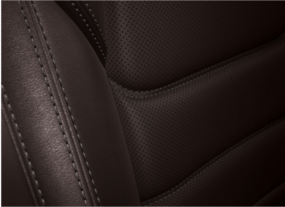
Dark Russet nappa leather# with light grey stitching (Akera)