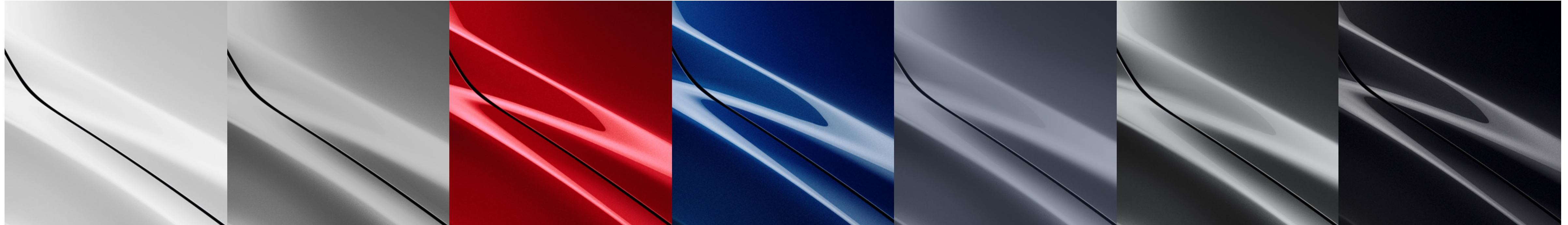
Rhodium White Metallic~