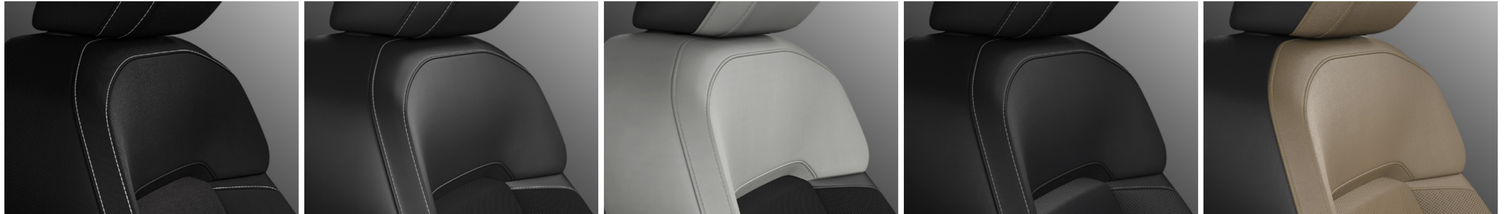
Black Cloth (Pure and Evolve)