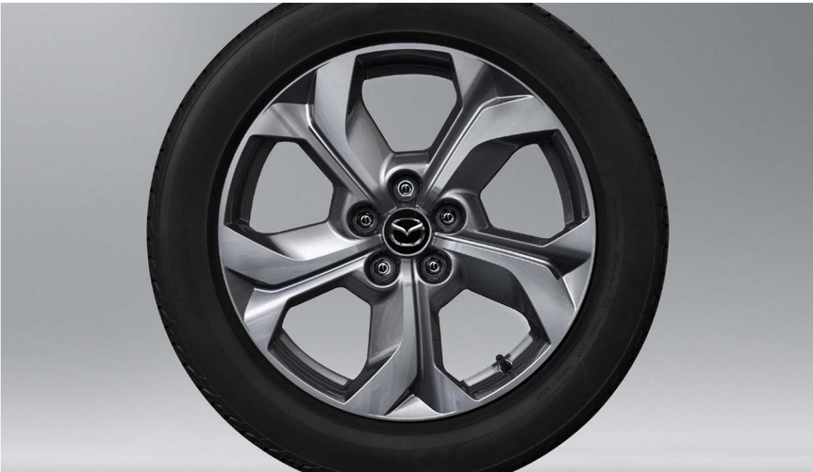
18-inch bright alloy