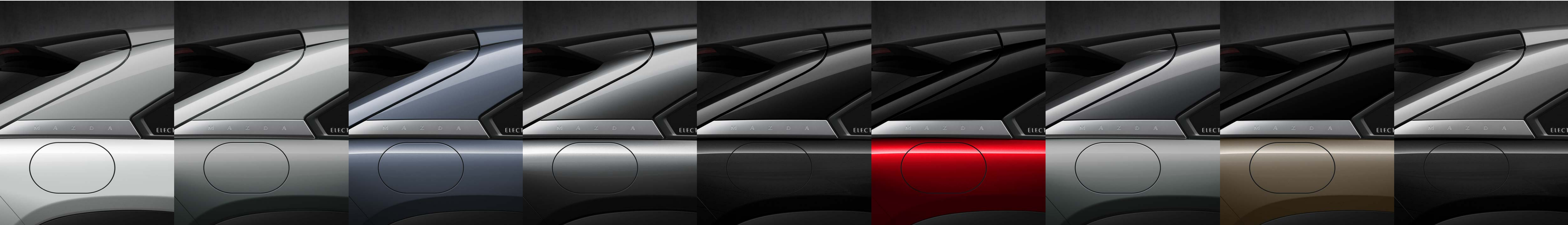
Arctic White Ceramic Metallic Polymetal Grey Metallic~ Machine Grey Metallic~ Jet Black Mica~ Soul Red Crystal Metallic with black roof~ Ceramic Metallic with black roof top and grey sides~ Zircon Sand Metallic with black roof~ Jet Black Mica with silver roof~