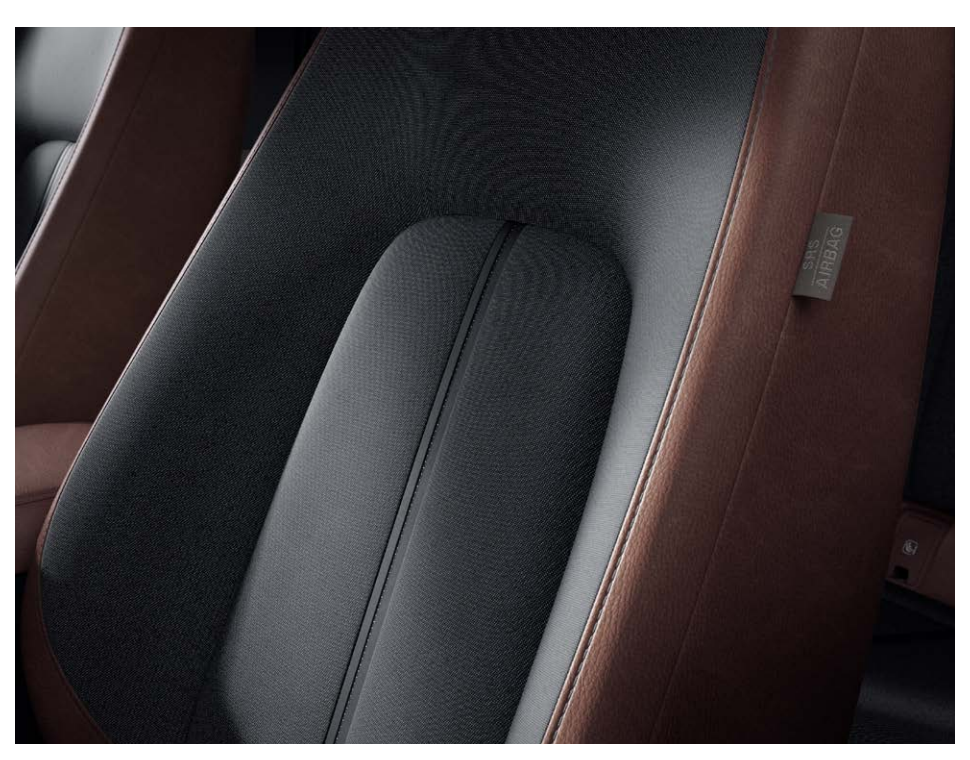
G20e Astina – Vintage Brown Maztex with black cloth G20e Evolve and Touring – 18-in silver alloy