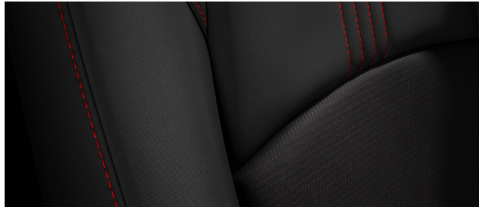
Black cloth/red stitching (G15 Evolve)