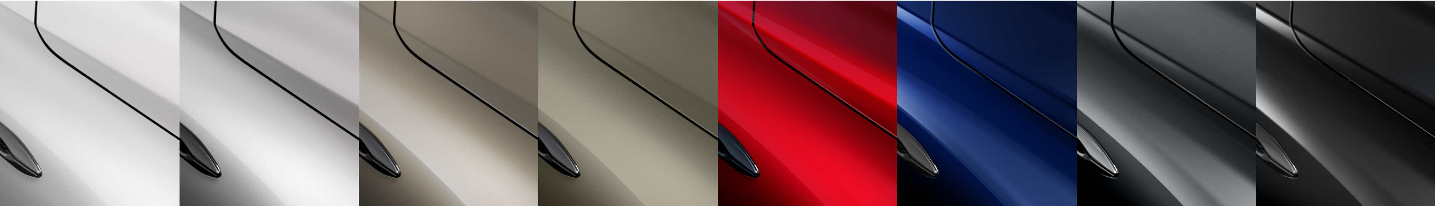
Rhodium White Metallic~