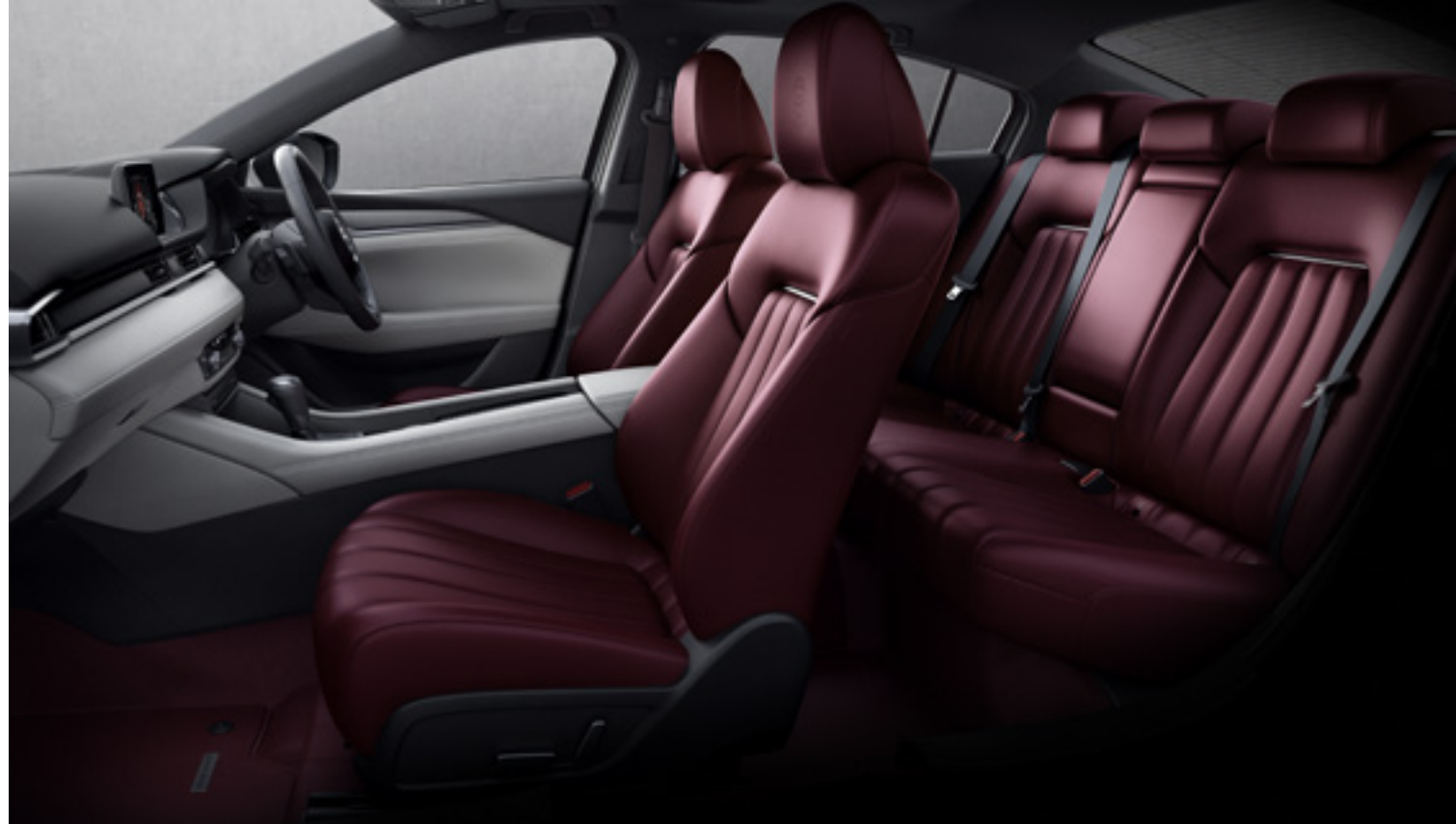
Overseas model shown.